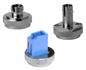
Quick-change adapters allow users to adjust the DLS 350 output to match their testing situation. See next page for full list of adapters.

The 2kHz tone output of the DLS 350 will be recognized by ODM power meters to provide a fast, simple continuity test on MM fiber.